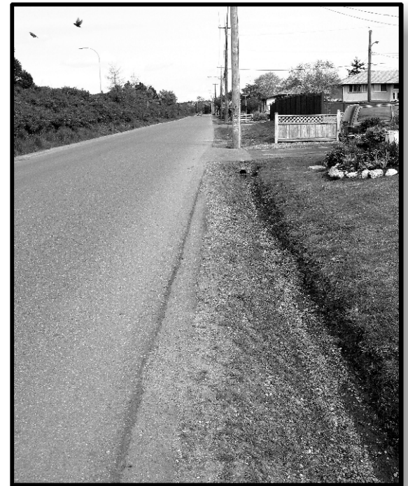
The second phase of the Douglas sidewalk project will see a new sidewalk on the section from Lily to Genevieve. At present, this is a dangerous place for school children to walk