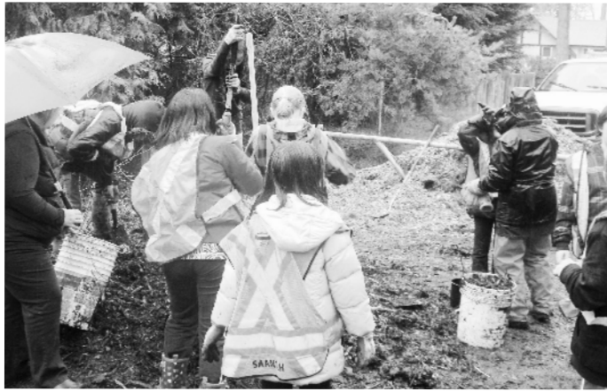
Lake Hill students assisting Beckwith Park restoration efforts by planting trees/shrubs at Morris trail entrance.