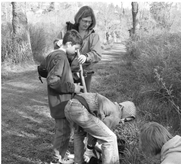
Students working hard to improve our parks!