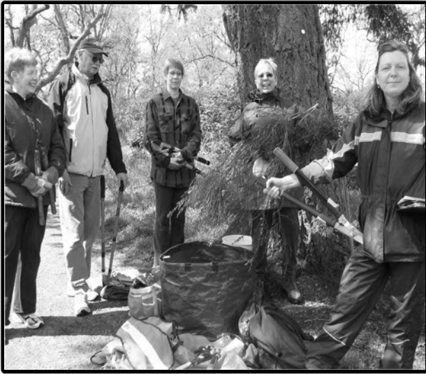
Friends of Beckwith on a work party